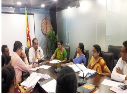
Conducting Special discussion with Stakeholders & Manufacturers of Helmet