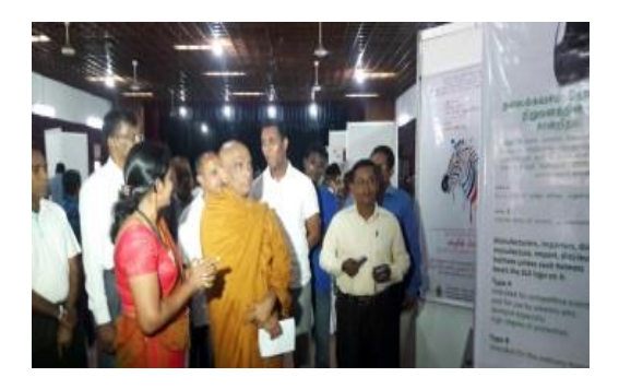
Exhibition stall of CAA at Eco-V exhibition at Public Library, Colombo