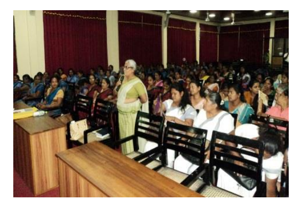
Conducting Awareness for members of Co-operative Women's Organization at Gampaha